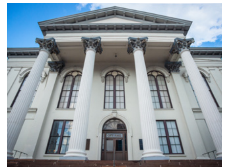
Case study Local government