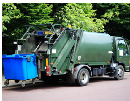
Case study Waste management