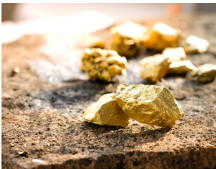
Case study Gold mining

Discover how MonitorPro enhances productivity