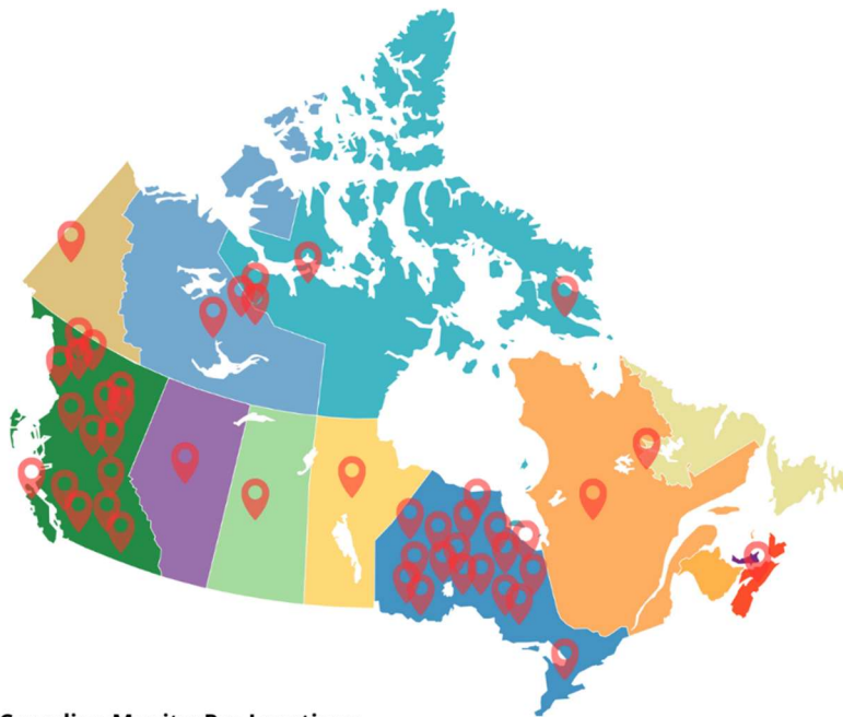
Canadian MonitorPro Locations

Working alongside some of the biggest corporate enterprises in Canadian mining, providing the best solution to manage their environmental accounting, MonitorPro is a comprehensive environmental accounting process, which is highly configurable with incredible flexibility and scalability.