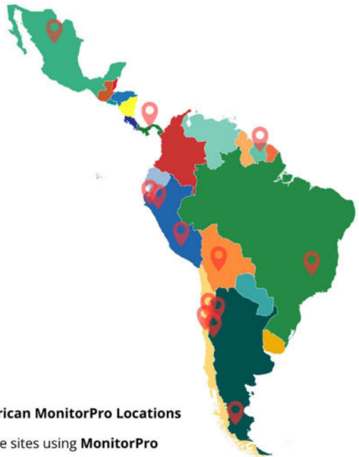
Latin American MonitorPro Locations

Working alongside some of the biggest corporate enterprises in mining, providing the best solution to manage their environmental accounting, MonitorPro is a comprehensive environmental accounting process, which is highly configurable with incredible flexibility and scalability.